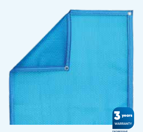
BLUE BLUE - 500 400 microns bubble cover, blue colour.