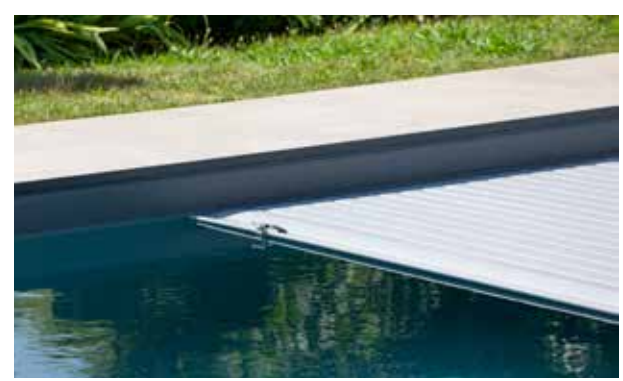
Our custom-made slats fit your pool shape to perfection.