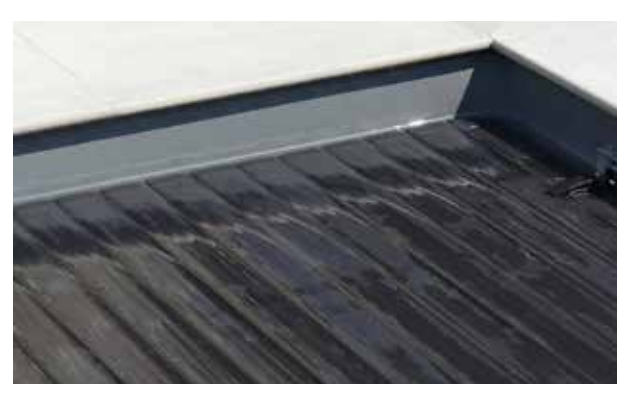
Our custom-made slats align perfectly with the edges of your pool.